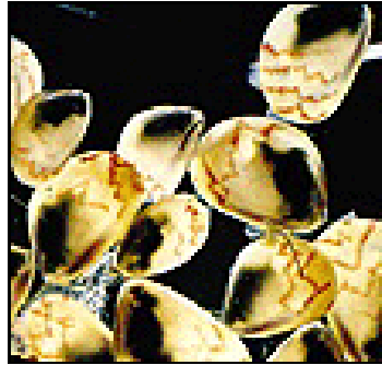
Spat under a microscope